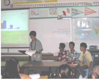
PRISM Student Presentation

The students of Moloka`i demonstrated enormous talent during their presentations at the 7 th Annual PRISM Symposium. PRISM: Providing Resolutions with Integrity for a Sustainable Moloka`i, is a program at Kualapu`u Elementary School, that emphasizes environmental education and explores sustainable living techniques by embracing concepts of responsibility and accountability.