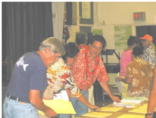
Community meeting with residents on Moloka`i